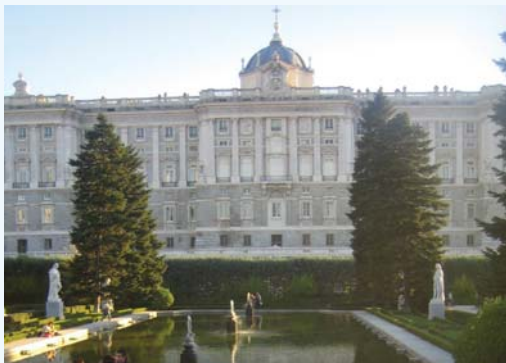
The Sabatini Gardens

Visit Príncipe Pío and indulge your cultured side with a visit to the Glorieta de San Antonio de la Florida, where you will find a beautiful fresco by Goya and the tomb of the man himself. Next, hook up to the internet and have a look at Fnac's online Culture Club to find an array of evening activities in stores throughout Madrid such as book signings to film screenings and poetry readings and comedy. Panteón de Goya, Glorieta de San Antonio de la Florida, Paseo de la Florida, s/n (Metro: Príncipe Pío). Open: Tues-Fri, 9.30am-8pm; Sat-Sun, 10am-2pm. Open: Mon-Sat, 10am-10pm; Sun, 11am-10pm. Fnac Culture Club: see www.clubcultura.com/cultura/fnac/agenda.php for more information.