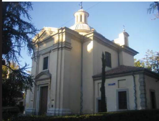
Take a peek inside for free at Goya's tomb