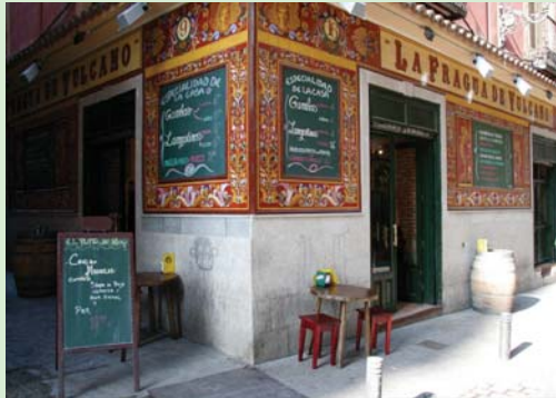
La Fragua del Vulcano

Third stop: El Sur. El Sur stocks a good selection of